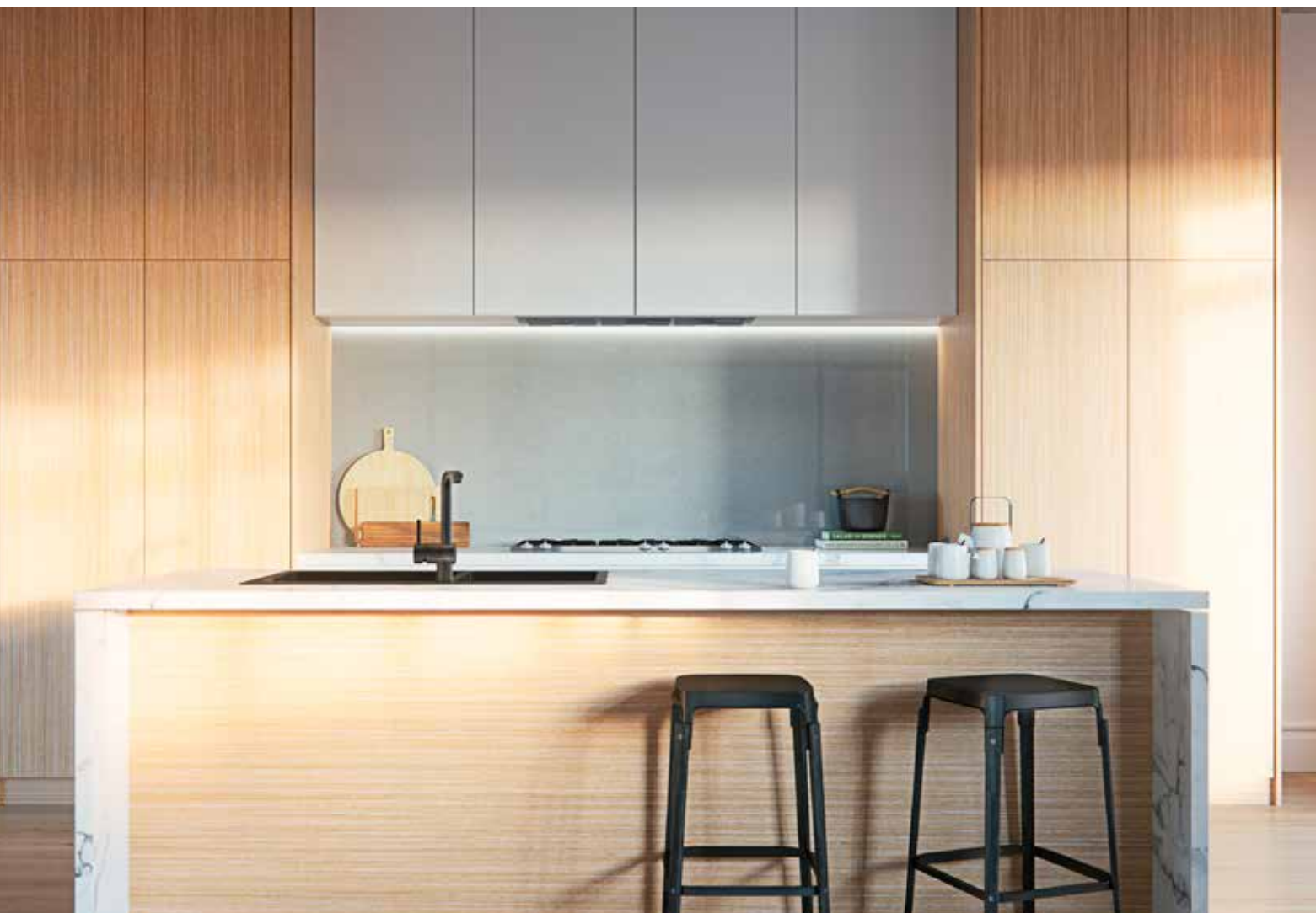
Germancraft Kitchens Top Splashback in Allplastics Metaline Black Ice. Benchtop in Allplastics Alfresco Compact Laminate Manganese. Bottom splashback in Allplastics Metaline in Palladium Perle .