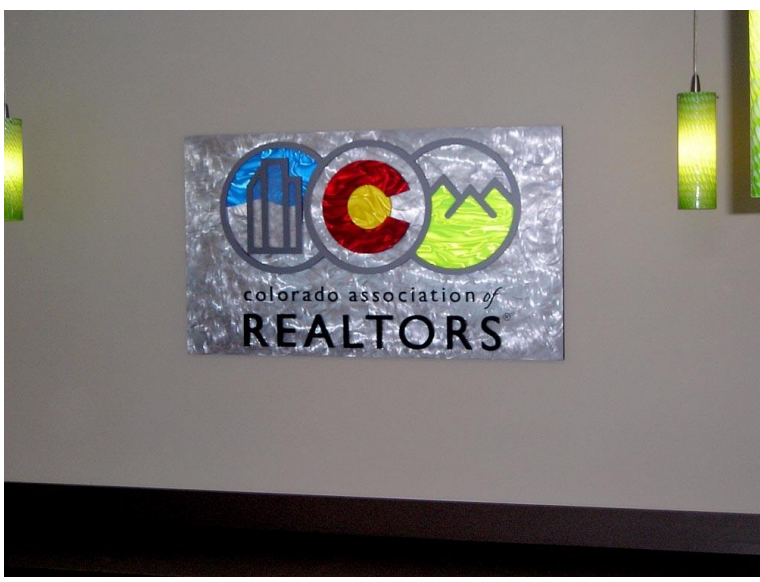
Rowlux - Colorado realtors sign