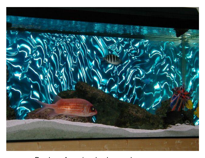
Rowlux - Aquarium background