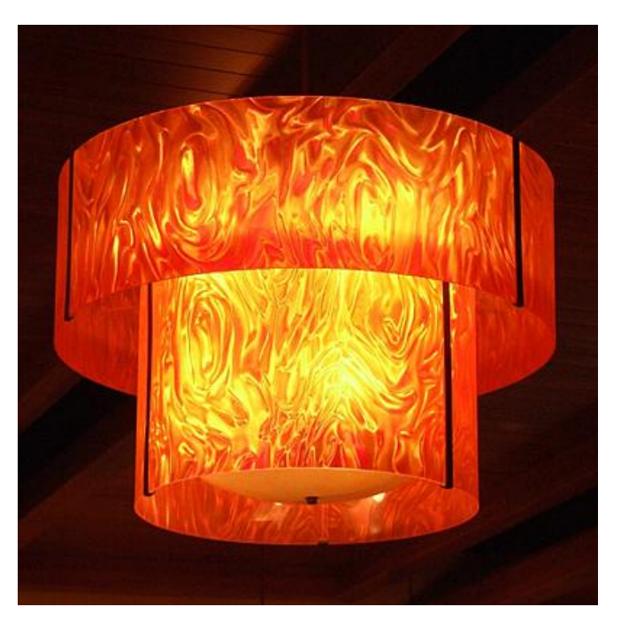
Rowlux - Lighting Industry