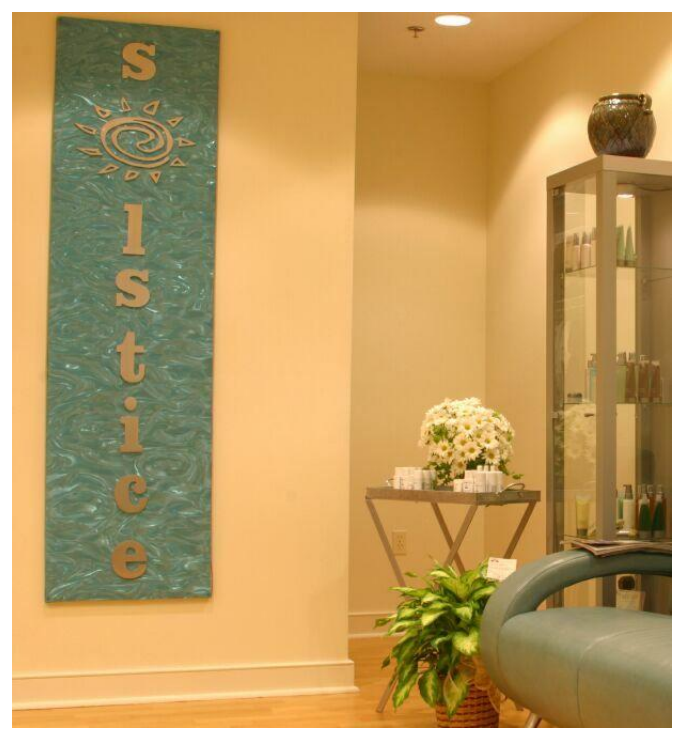
Rowlux - Spa Sign