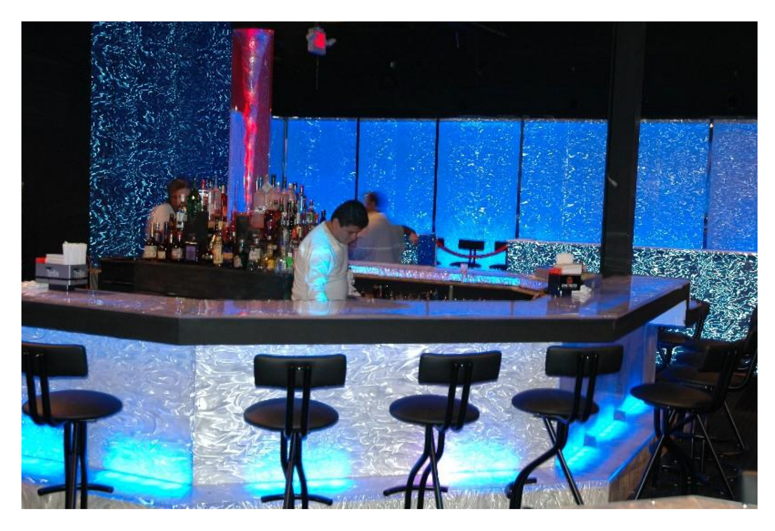
Rowlux - Entire night club