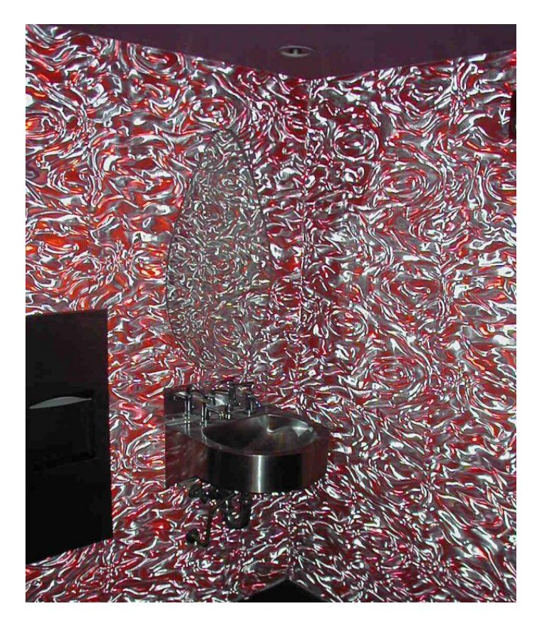
Rowlux in bathroom