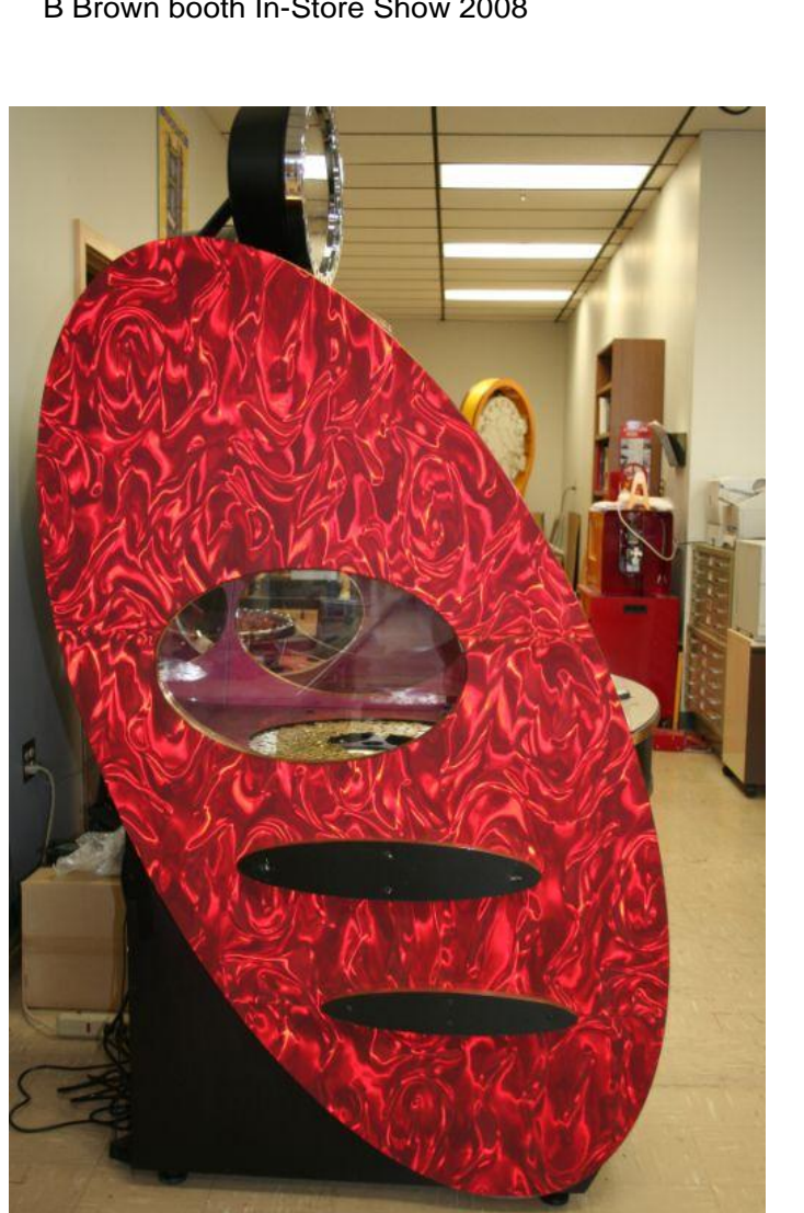
Rowlux - Arcade Game