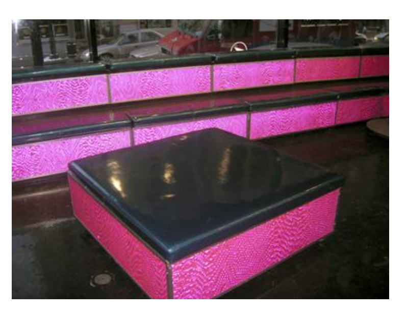
Rowlux - Inside a retail store