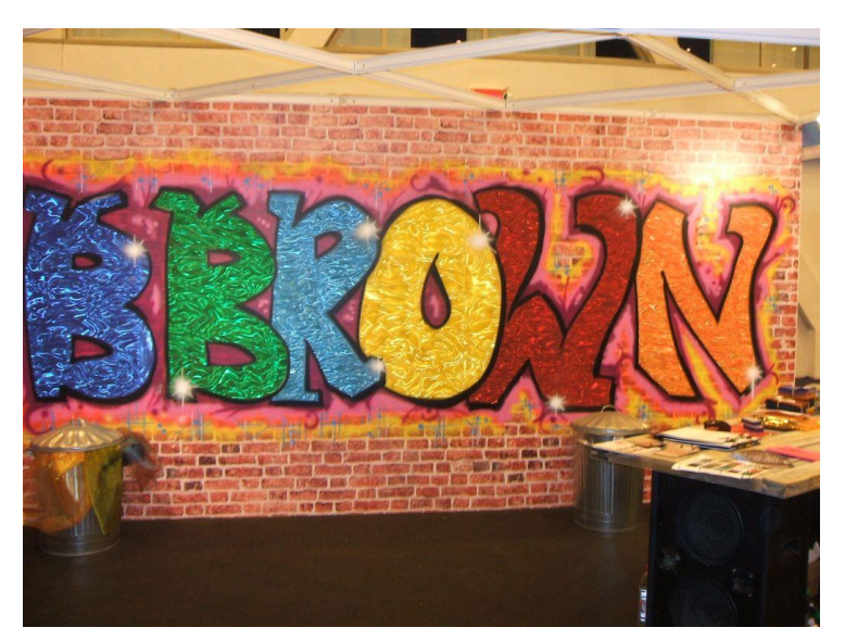
B Brown booth In-Store Show 2008