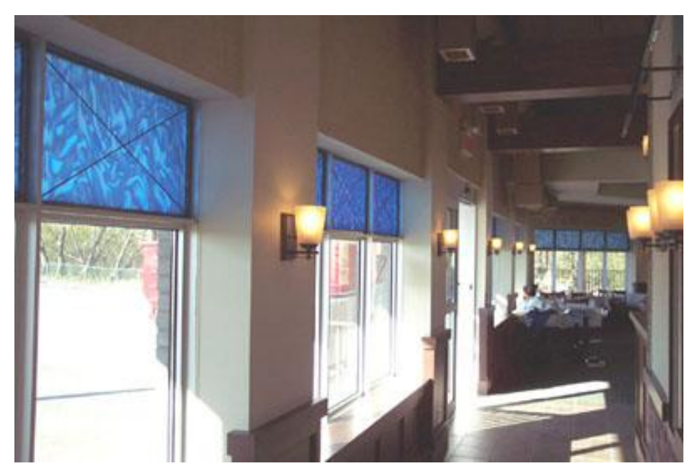
Rowlux window in restaurant