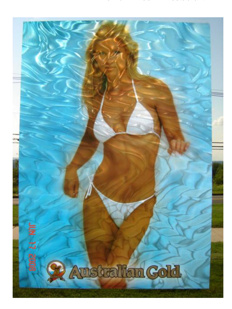
Rowlux - Poster Ad