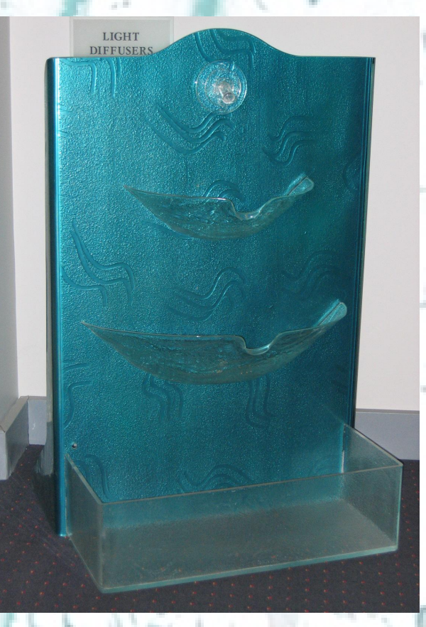
Water Feature - Dreamtine Texture