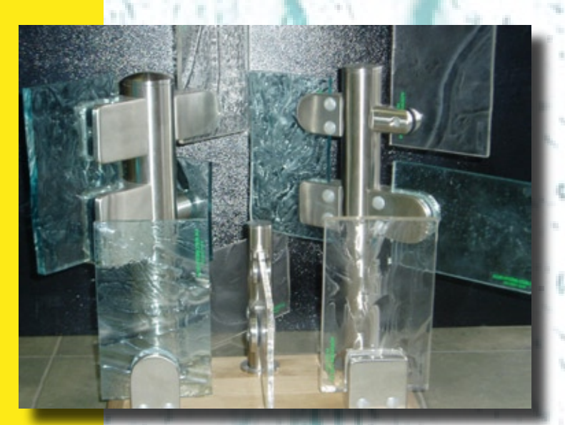
Assorted fixing options

Splashback - Backsprayed Dreamtime texture