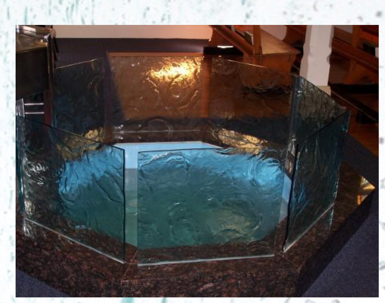
Balustrating - Marine Tint