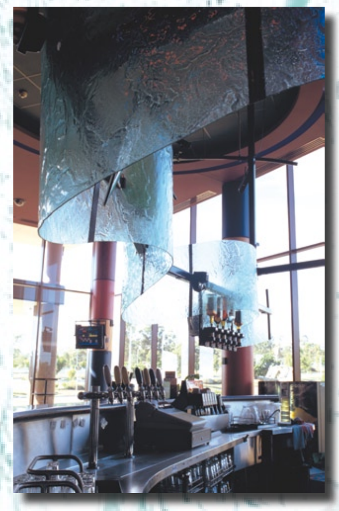
Cold formed feature - Rough texture