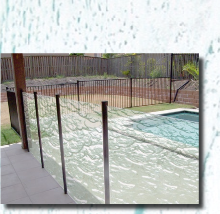
Pool Fence-Sandstone texture