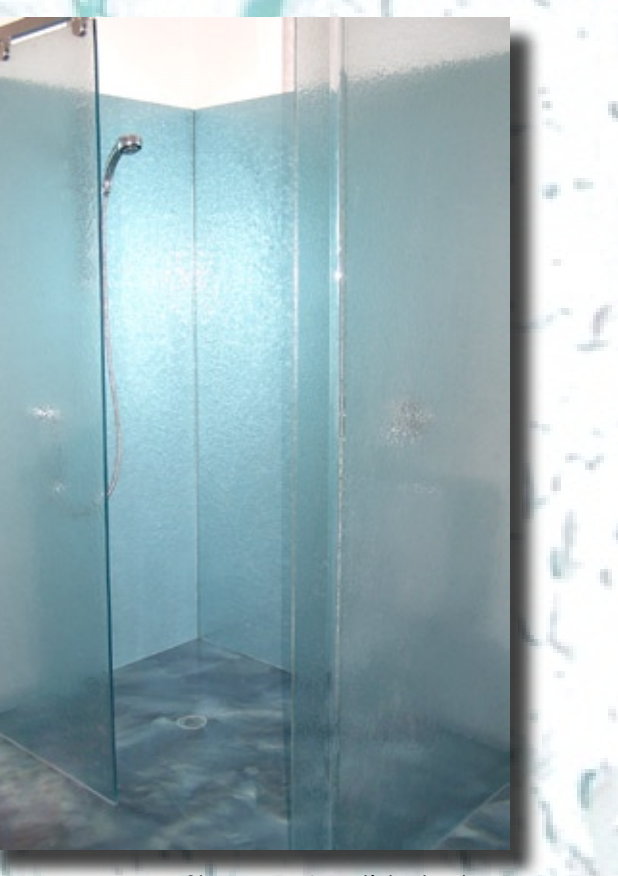
Shower - Lowtide texture